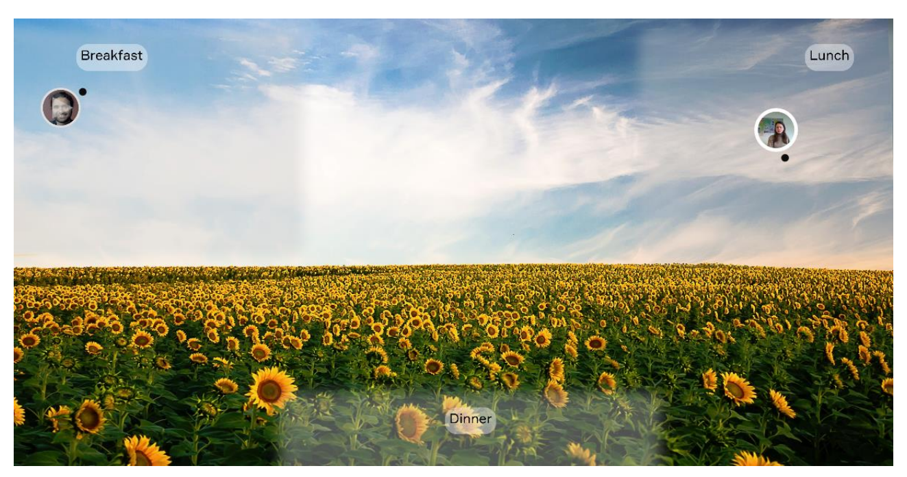
Figure 4: Wonder platform