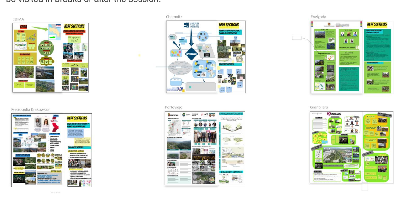
Figure 3: Virtual city posters in Miro

Description: Each city is asked to prepare a virtual poster on a certain topic for an information session. In this session, about 10 minutes are taken to present the poster via Miro and 5 minutes are foreseen for questions from the audience. Depending on the topic the timeframe can be adapted. Possible occasions and topics where posters were applied during the INTERLACE project are a general introduction of the city, an overview of local challenges related to NBS and an update poster after 1,5 years of project duration. The posters remain accessible to all participants via the Miro board and can be visited in breaks or after the session.